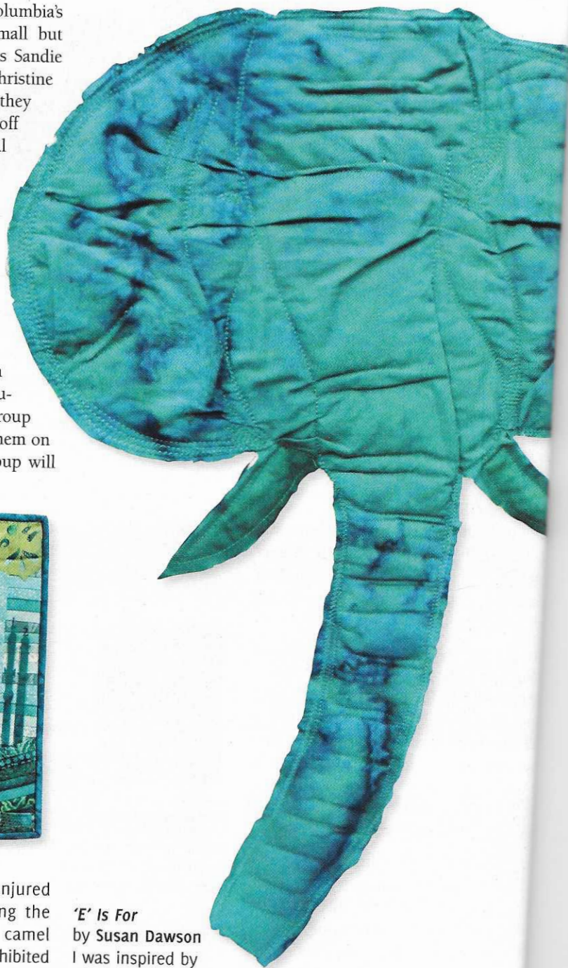
'E' Is For by Susan Dawson

Reflecting on a trip taken to Africa when I was 23, conjured memories of spices, textiles, hand-tooled metals, hearing the punji of a snake charmer and experiencing a meal of camel meat. The mosques were the most notable, as many prohibited women from entering until they were 80 years of age. Not sure if this was the same rule for cats. This work incorporates the textural and multi-sensory facets of Morocco in the midnight skyline. Materials and methods: satin, lace, burlap, netting, fleece, flannel, silk and glass beads, crazy and strip quilted with reverse appliqué.