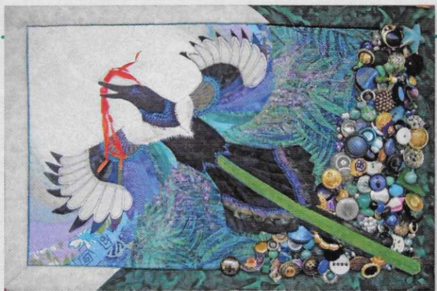
Magpie by Catherine Henderson

A magpie's iridescent feathers are rarely seen other than in split second photography. These birds are well known for their attraction to objects that are shiny or different from their surroundings. Of all the exotica available, this magpie stole the one item that is of a complimentary colour to emerald. Materials and methods: commercial cotton, tulle, vintage silk, paper-pieced, machine-quilted, Wonderfil® rayon threads, Angelina® fibre, vintage and contemporary buttons, beads and jewels.